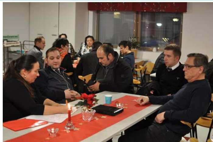
Workshops in Rovaniemi dealt with local priority areas.

As in the events organised during the previous project, the event held in Rovaniemi used dialogue methods facilitated by the Monkey Business coaching company. The participants were divided up into workshops to discuss important aspects of the Roma policy programme affecting the everyday lives of Roma people in the county, and to share experiences on the functionality of public services and examples of different cooperation networks and forms of Roma work. Participants also brainstormed ideas for this year's summer camp.