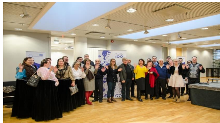
Smily faces after a succesful event in Helsinki.

The importance of attitudes was brought up at the meeting, both regarding the majority population's attitudes towards Roma population and the attitudes of the Roma towards the majority. It was agreed on that genuine contacts, for example in connection with children's hobbies and school, are a good way to change attitudes. Such encounters give opportunities to get acquainted with new people and reduce prejudices. Due to the approaching municipal elections, participants encouraged the Roma to get engaged in politics and to use their own expertise to further develop society.